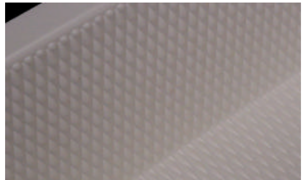
Inside Textured Bucket